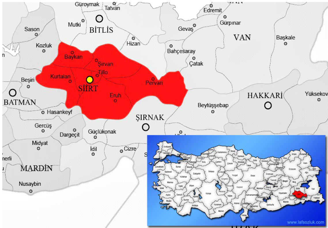
Figure 1. Location of Siirt Province and Districts

The scope of this Contract covers Solar Power Plant (SPP) Project in Tillo (Siirt) as detailed in this Terms of Reference. The following figures show Tillo (Siirt) District and the satellite image showing the location of the project area.